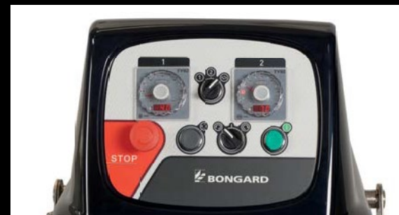
Electromechanical for models 80 and more