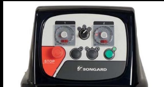
Electromechanical controls for models 50 and 70